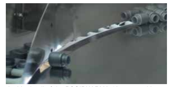
Inside detail of the POSIPHARMA-13 unscrambler

The containers or caps are loaded into the unscrambler by a Hopper Elevator where they are distributed on the upper rotating disk (1) and fed in to the "selectors" located around the periphery of the disk (2). There is no potentially damaging mechanical manipulation of the containers or caps during the unscrambling process; the containers or caps are moved simply by air and gravity.