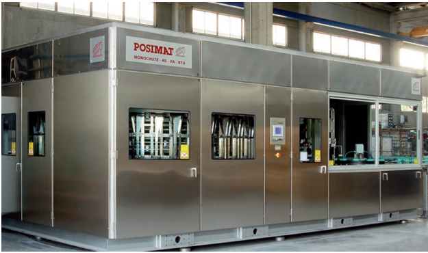
Unscrambler model MONOCHUTE-40 with POSIFLEX-A changeover system, integrated BTU* in monoblock and soundproof cabin in stainless steel

The top of the machine is fitted with a split lid reducing noise emission as well as preventing access to the machine whilst is operating.