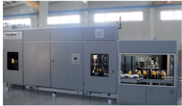
Unscrambler model MONOCHUTE-45 with POSIFLEX-A changeover system and integrated Rotary Orientor in monoblock