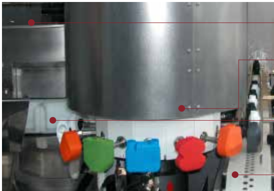
Interior of the POSIBOT unscrambler