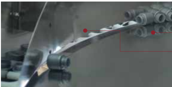
Interior of the POSIBOT unscrambler

The rotating device does not require any type of adjustment to perform the changeover process.