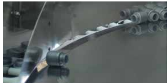
Inside detail of the POSIPHARMA-13 unscrambler

The containers or caps are loaded into the unscrambler by a Hopper Elevator where they are distributed on the upper rotating disk (1) and fed in to the "selectors" located around the periphery of the disk (2). There is no potentially damaging mechanical manipulation of the containers or caps during the unscrambling process; the containers or caps are moved simply by air and gravity .