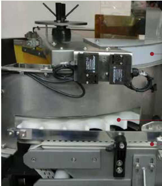
Inside of the POSIPHARMA-13 unscrambler